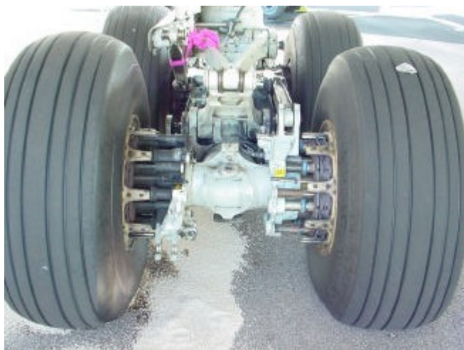
The broken lug (bottom left) of the right MLG

One witness stated that during the acceleration phase of the take-off he had noticed a blowpipe flame from the exhaust cone of engine #1 twice, followed by a bang. Another witness noticed one blowpipe flame during the acceleration phase and two white plumes of smoke originating from the tires after the take-off had been rejected. When the aircraft taxied from the runway air traffic control instructed the flight crew to hold the aircraft because of smoke development and some flames near the right main landing gear (MLG). The crew stopped the aircraft and the engines were shut down. The airport fire fighting services were on standby to keep the situation under control. No crew members or passengers got injured.