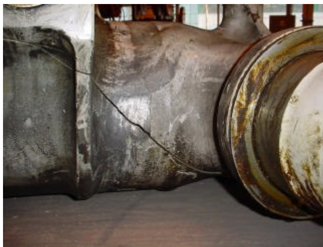
The crack in the right MLG bogie beam